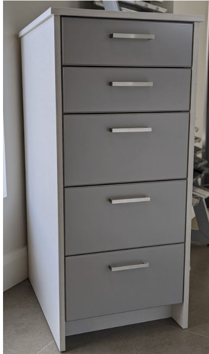
DRAWER BOX DISPLAY SHOWCASING ALL NEW DRAWER BOXES