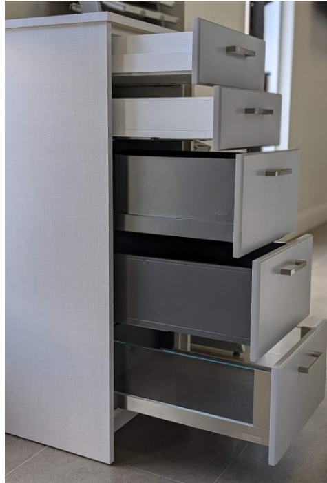
DRAWER BOX DISPLAY SIDE PROFILE