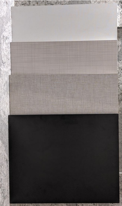
INTERIOR FINISHES NEW INTERIOR FINISHES FOR ALL SERIES